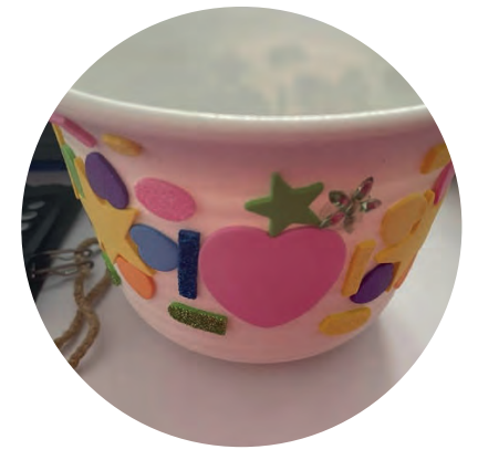
Created by Erica