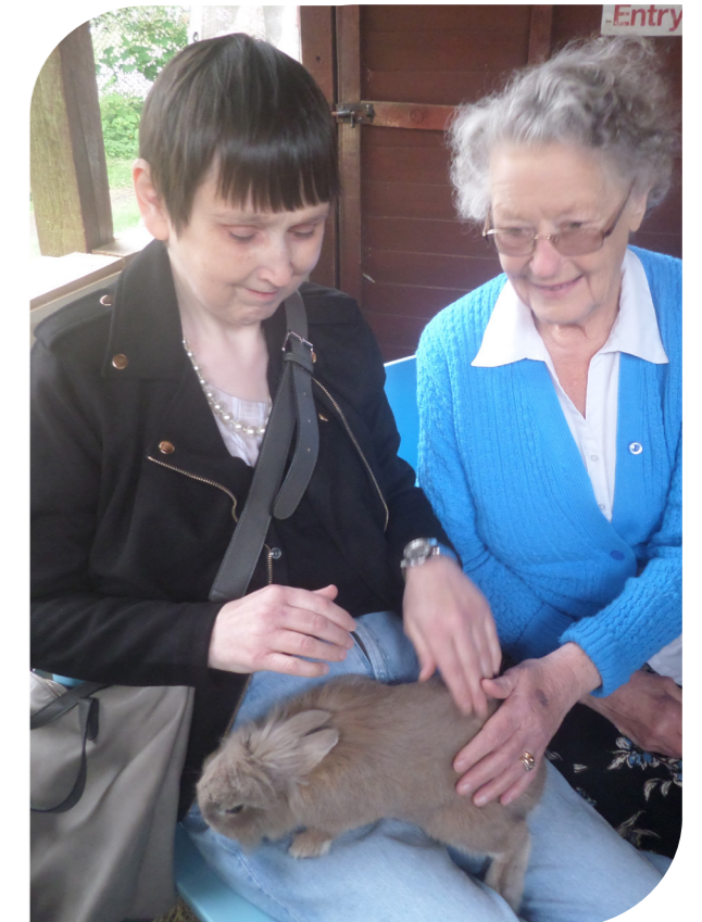
Stroking a grey rabbit at Floralands