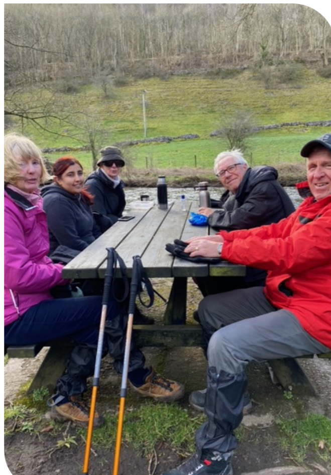
Ramblers enjoy a Chat

For those looking for a short distance walk around local country parks and canals there is our Walkie Talkie Wednesdays Group. These walks provide a sociable environment and sighted guided support and take place every two weeks.