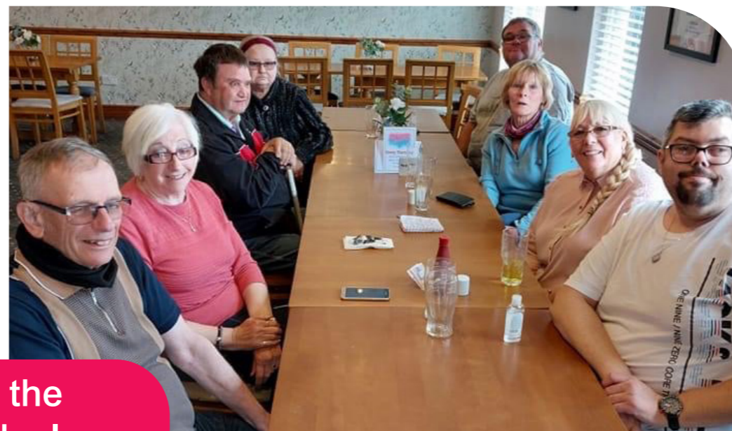
Lunch at the Shire Oaks Inn

“I've been really pleased to do the quiz because it kept us together as a group in lock down. The quiz broke the week up and kept our minds active.