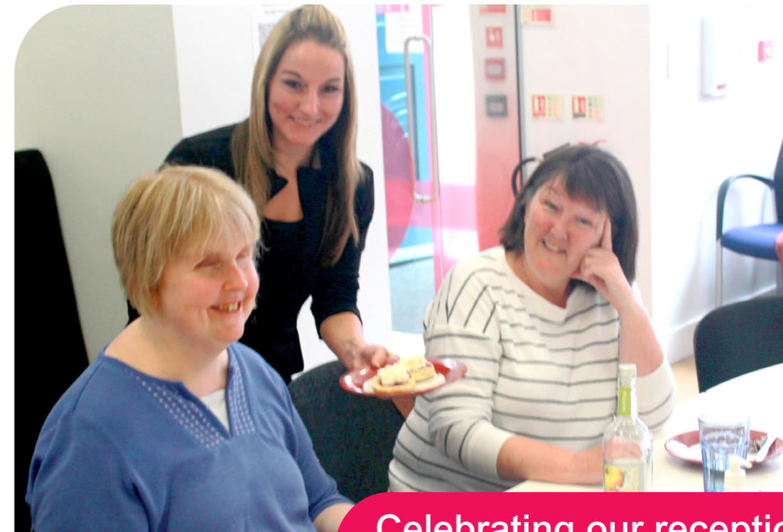
Celebrating our reception volunteers with afternoon tea!

Now that things are settling after the pandemic, we hope to put in place plans to expand our sports and healthy lifestyles service into the county. We also hope to reinstate our arts and crafts sessions. Please see our website and social media pages for updates.