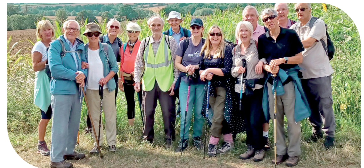
Hiking group in sunflower field