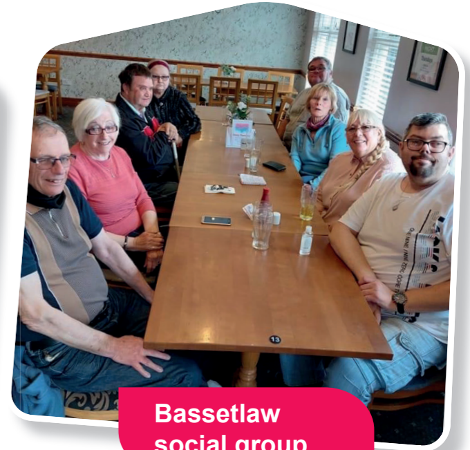
Bassetlaw social group