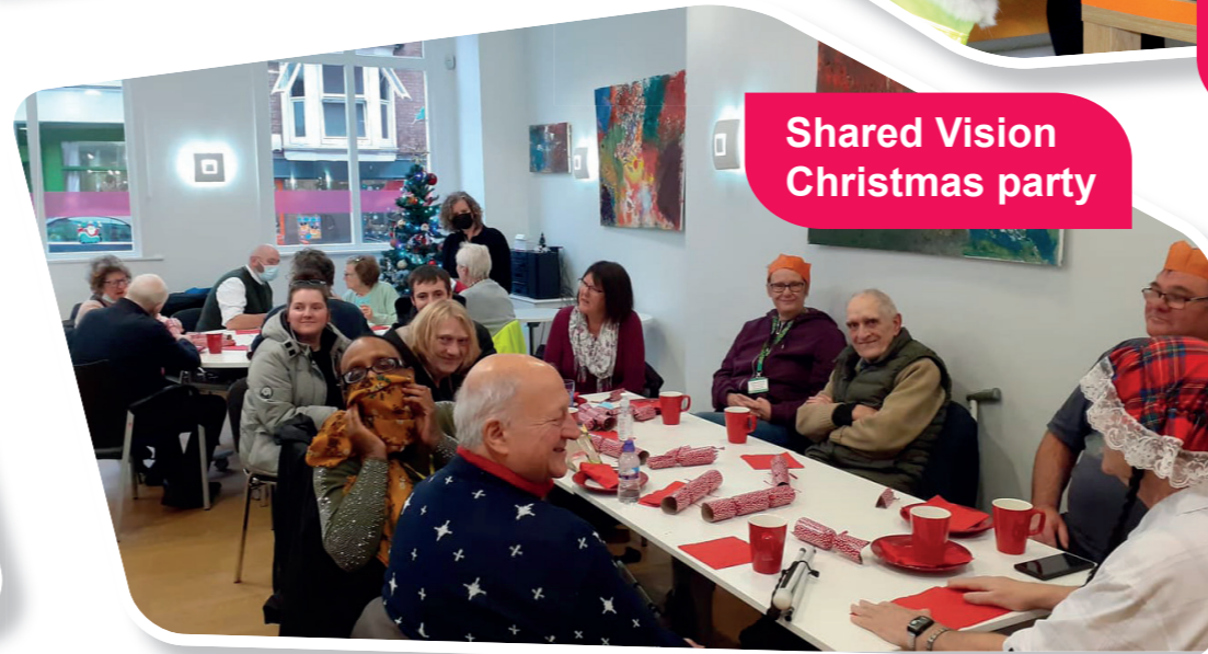
Shared Vision Christmas party