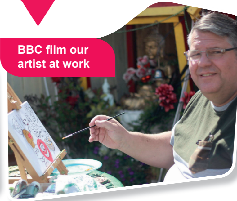
BBC film our artist at work