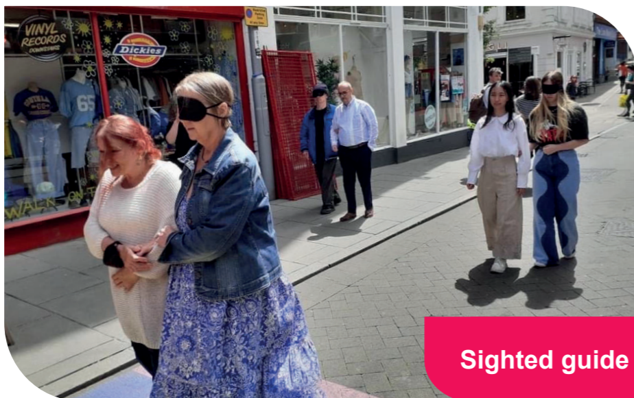
Sighted guide training