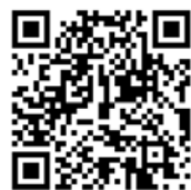
Professional referral form

Please scan these QR codes for My Sight Notts referral forms