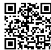
Self referral form